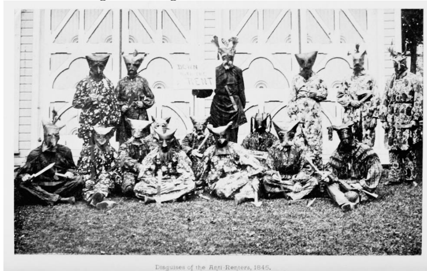
Figure 4: Disguises of the Anti-Renters 214

It may seem bizarre to find this eighteenth-century style of political engagement, the mobbing of “groups who could find no alternative institutional expression for their demands and grievances, which were more often than not political,” enduring into the 1840s. 215 We are used to celebrating, along with the Founders, the creation of a rational, participatory government in which law is based on the consent of the governed. The white Indian tradition is, by contrast, a carnivalesque spectacle, involving ritualistic demonstrations of the people’s raw physical power, and it seems a relic of a legal regime characterized by hierarchy and inherited position. Its continued usefulness suggests that many Americans—even white, male Americans—did not experience the transition from status to contract, from hierarchy to equality, from the politics of deference to the politics of reasoned persuasion. If, indeed, this is part of the explanation, the symbol’s late appearance in the context of the feudal estates of upstate New York makes perfect sense.