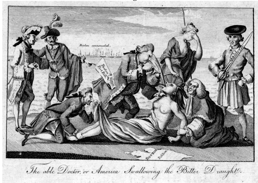
Figure 1: The Able Doctor, or America Swallowing the Bitter Draught 76

In Virginia, frontiersmen’s clothes, incorporating elements of Indian costume, became the uniform of the moment. When Lord Dunmore dissolved the Virginia assembly in 1774, an observer reported that a group of 1,000 men assembled in protest, “among which was 600 good Rifle men. . . . [E]vry Man Rich and poor with their hunting shirts Belts and