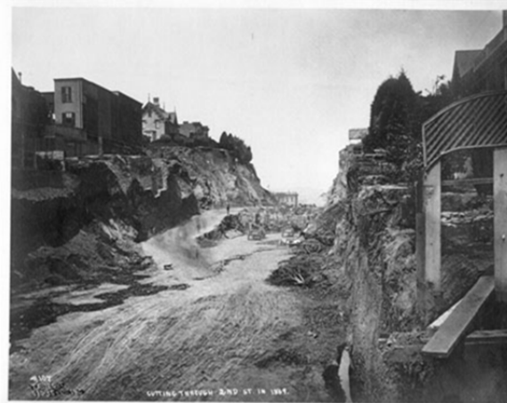
Figure 3, Second Street Cut, San Francisco, 1869 131

By 1902, four more states amended their takings clauses to include compensation for property “taken or damaged.” 132 Indeed, new states preferred the “taken or damaged” framework. With only one exception, 133 every state that entered the union after 1870—the date that Illinois changed its constitution—included “or damaged” in its takings clause. 134