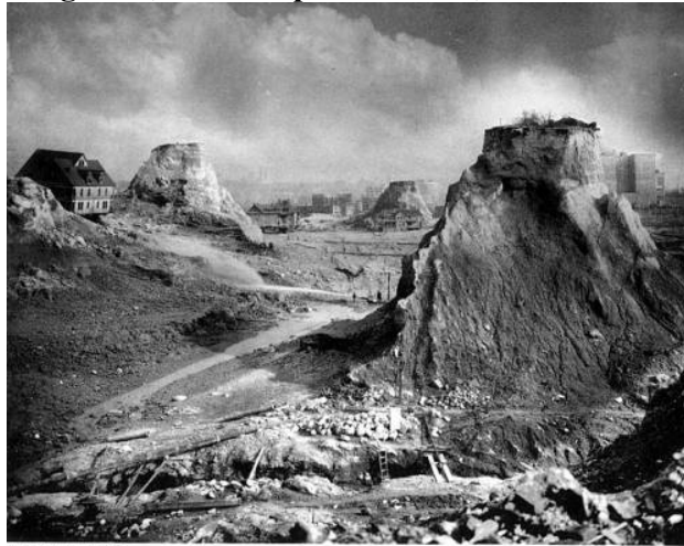
Figure 4, Seattle Spite Mounds, 1909-1910 201