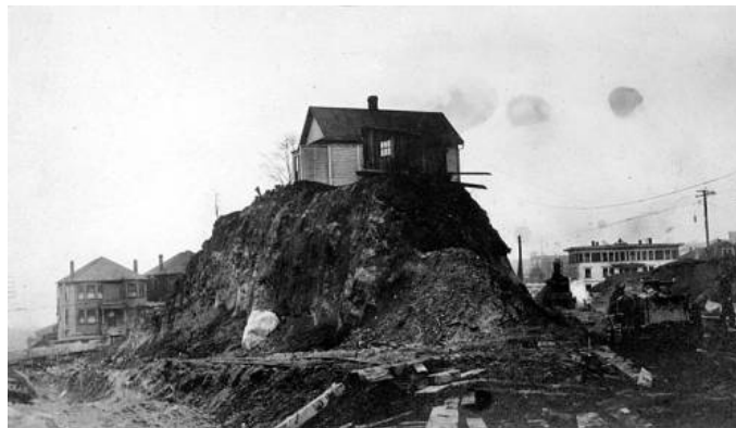
THE LEVELING OF THE HILLS TO MAKE SEATTLE