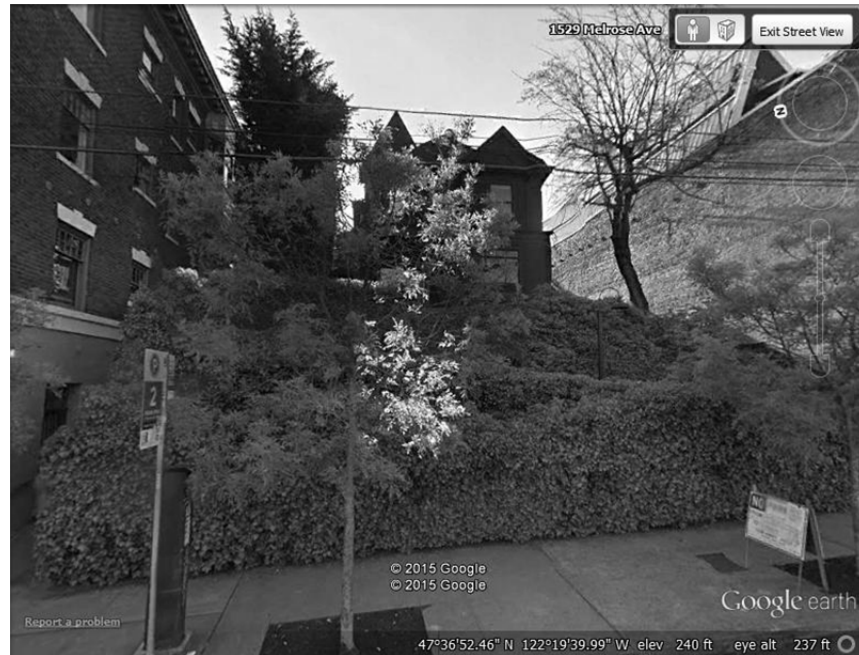
Figure 5, House at 1516 Melrose, Former Spite Mound, 2015 202