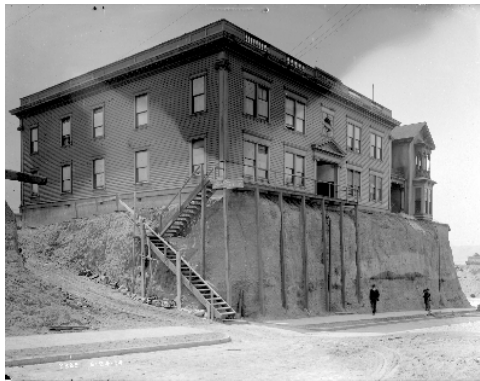
Figure 1, Hotel and Apartments During Regrade, Seattle, 1914 14

During the course of the nineteenth and early twentieth centuries, one of the most significant problems in property law was presented by a new urban challenge: street regrading. Local governments believed that leveling the hills and filling in the lowlands would bring a variety of improvements to health, transportation, and urban life. One problem, however, was that many individuals owned land, homes, and businesses along the existing hills and valleys. The process of regrading generated substantial conflict between local governments and residents whose homes were left significantly devalued, sometimes atop cliffs, as in the photograph reproduced below.